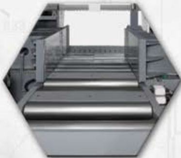
Hydraulic bar feed system ensures accurate positioning.