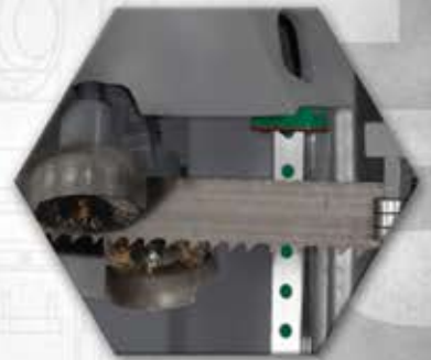
Dual wire brushes ensure chip removal for extended blade life.