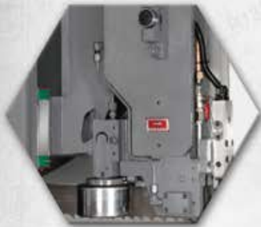
Automatically positioned guide arm with anti-vibration feature.