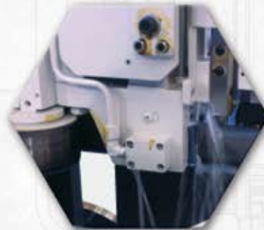
Anti-vibration roller for more accurate cuts and longer blade life.